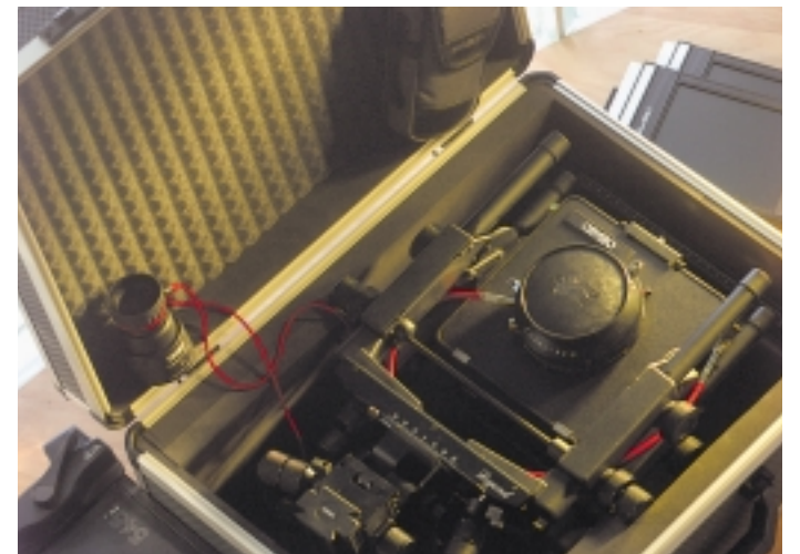
Cambo Legend 4x5 easily dismantles to fit into its optional custom carrying case.

For detailed specifications on each Legend camera, please turn to page 9.