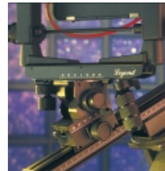
The Legend Plus model features yaw-free base tilts to help control sharpness and shape.