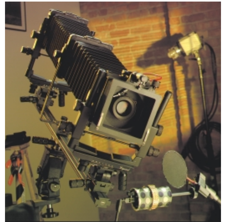
Cambo's extensive accessory system provides plenty of extension for macro applications. Legend Plus shown here with optional extra standard bellows, bellows coupling standard, 25 1/2" rail extension and deluxe compendium shade.

Includes U-frame standards with base tilts, two-section monorail, heavy-duty mounting block, bellows support and easy-loading back with ruled ground glass. (Lens and lensboard not included.)