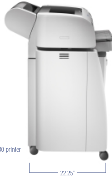
Profile: Shown with the Epson Stylus 4000 printer