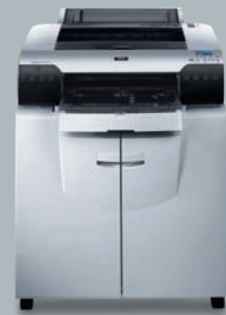
Epson Stylus Pro 4800 Shown with optional printer stand