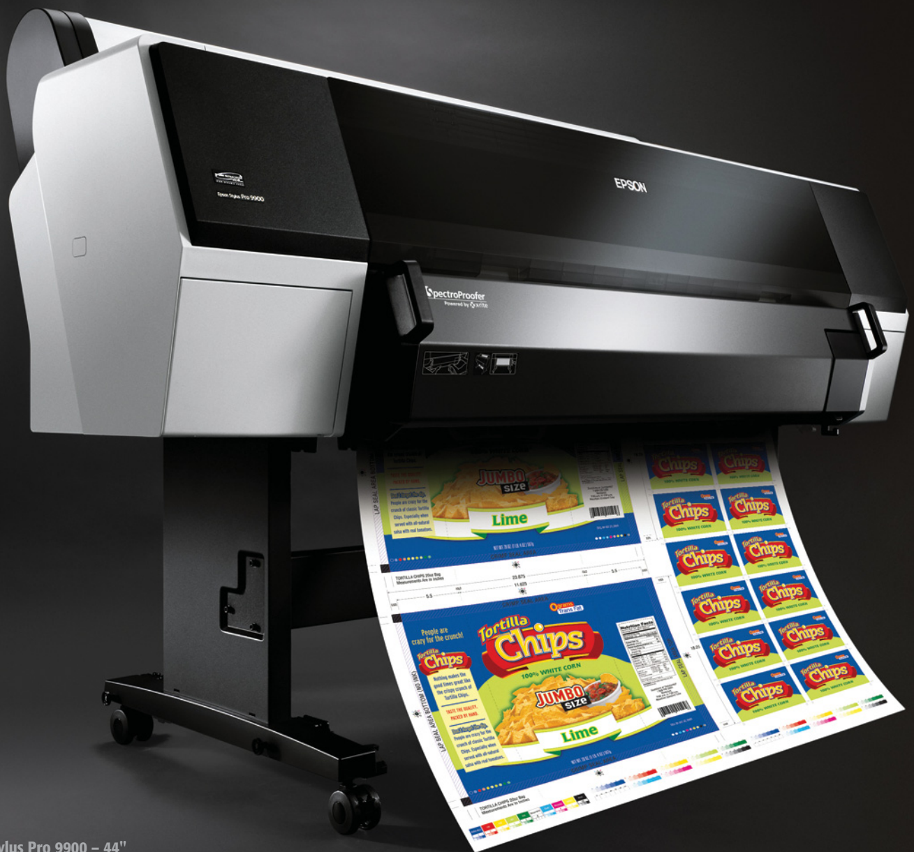
Epson Stylus Pro 9900 – 44"