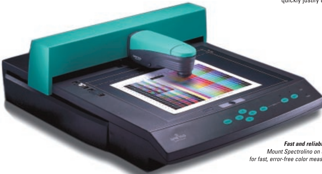
Fast and reliable: Mount Spectrolino on SpectroScan x/y table for fast, error-free color measurements.

For fast, automatic and error-free measurement of color charts, mount Spectrolino on GretagMacbeth's SpectroScan™ x/y table. The printed sample is held tight to the SpectroScan table with an electromagnetic charge. In addition, there is no need to worry about exact positioning. Simply teach Spectrolino the orientation of the chart on the table by defining three corner points. Now press start and walk away. The time saved in automating the measurement of many color charts can quickly justify the investment.