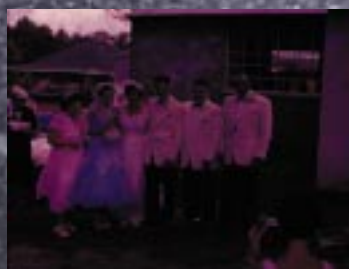
The original scan