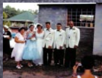
After running Digital ICE 3 ™ Image Enhancement technology

Digital ICE 3 ™, incorporated into Nikon Scan ® 3.0, eliminates all surface defects, corrects color and exposure, and automatically reduces the film grain of a scanned image.